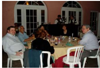
The executives enjoy a Mexican fiesta at the Don CeSar