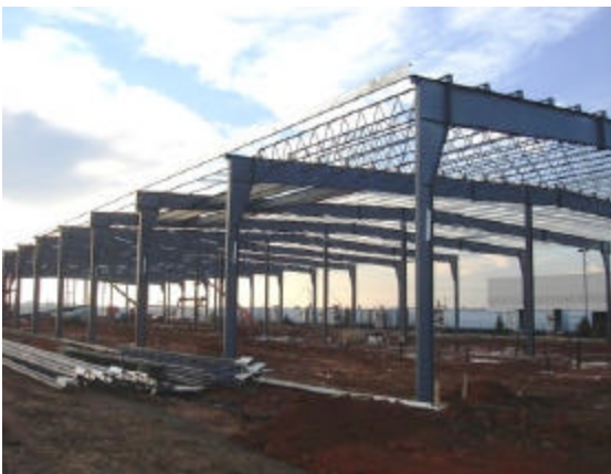
Above: Quick progress is made on the trades' wing of the new Orleans Tech facility.