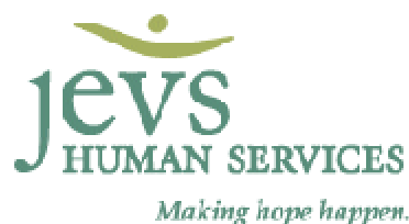
Pictured above: The new JEVS HUMAN SERVICES logo design.

Creating our new name and logo design was an exciting and collaborative process. After identifying an outside firm to take us through the process, a series of focus groups and interviews with leadership and staff at various levels in the organization proved to be invaluable. What emerged was a clearer picture of who we are and what we want others to know about us ---a platform on which to build our new brand mark and image. From there, a small team worked through various design and tag line options, keeping in mind the essential messages we hoped to convey to our constituents. With executive staff and Board leadership buy-in, the final "reveal" to the Board of Directors was a complete success.